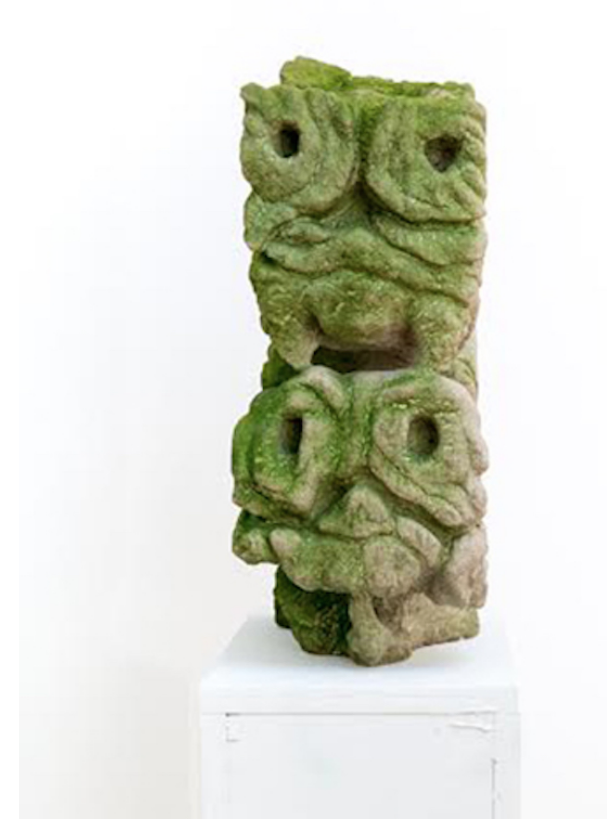
Jerry The Marble Faun, Pairs (Big Edie and Little Edie), 2009. Limestone and moss 13 1/2 x 19 x 6 ½ inches